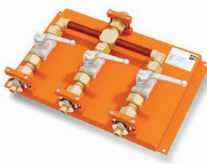
4 x DN20 Order no.: 3-718-R036