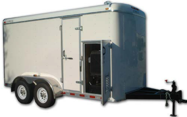
Dual-axle trailer shown with optional 35kW diesel genset

Can be mounted onto a trailer with the following accessories: