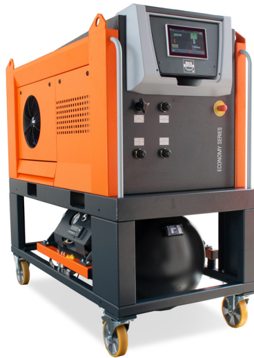
L057R01 with 300 l pressure tank

Optional additional equipment (mounted) at an extra charge : (ASME available upon request)