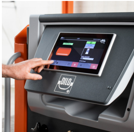
Operation, indication of the important process parameters and illustration of the selected gas flow on the control panel. Indication units (e.g. bar/mbar/kg) can be selected directly on the panel.