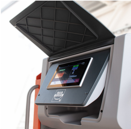
A swiveling control panel allows ergonomic working.

L057R01/R51 SF 6 gas service carts For liquid storage